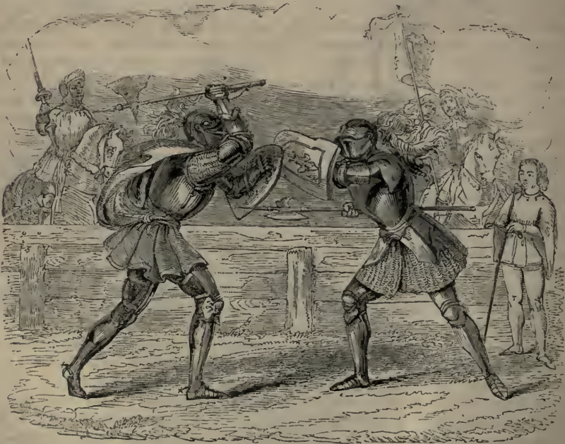
BATTLE-AXE FIGHT BETWEEN SIR JOHN HOLLAND AND SIR REGINALD DE ROIE. From cotemporary MSS., assisted by several cuts in Keiser's Maximilian.

After the courses of the lance, they fought three rounds with swords, battle-axes, and daggers, without either of them being wounded. The French carried off sir Reginald to his lodgings, and the English did the same to sir John Holland. The duke of Lancaster entertained this day at dinner all the French knights and squires: the duchess was seated beside him, and